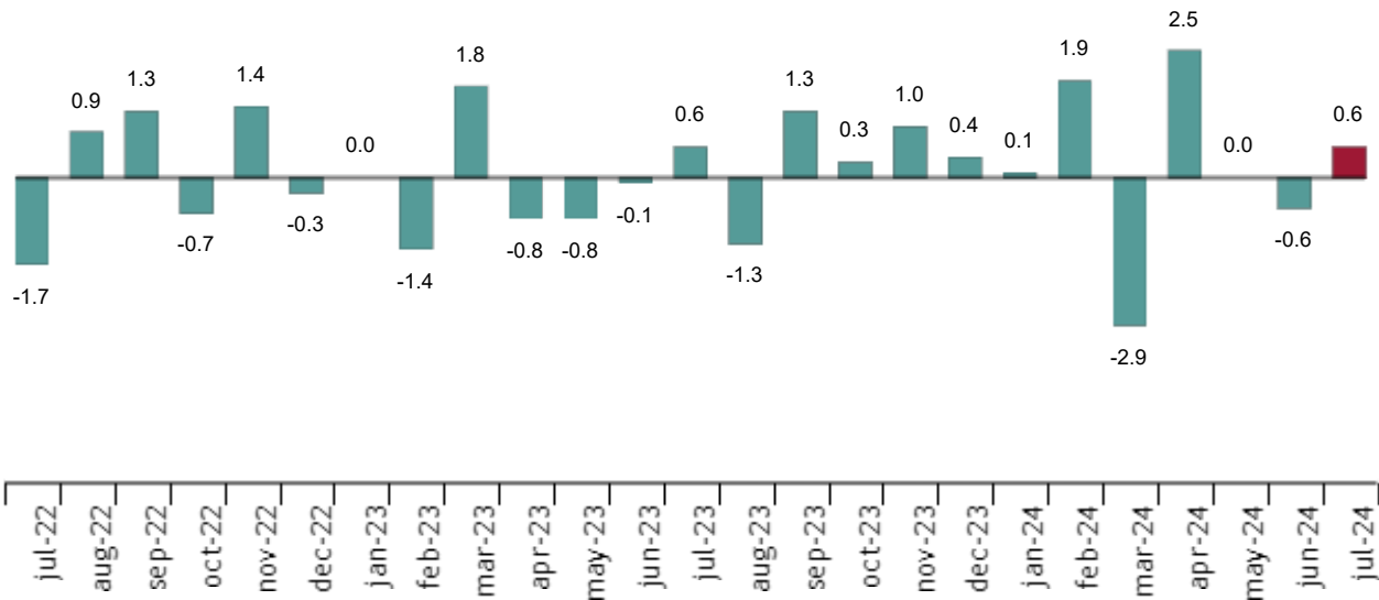
General index of the turnover for the Market Services Sector. Seasonally and calendar adjusted Monthly rate. Percentage

After adjusting for seasonal and calendar effects, the monthly variation of the general index of turnover for the Market Services Sector between July and June was 0.6%. This rate was 1.2 points higher than that observed in June.