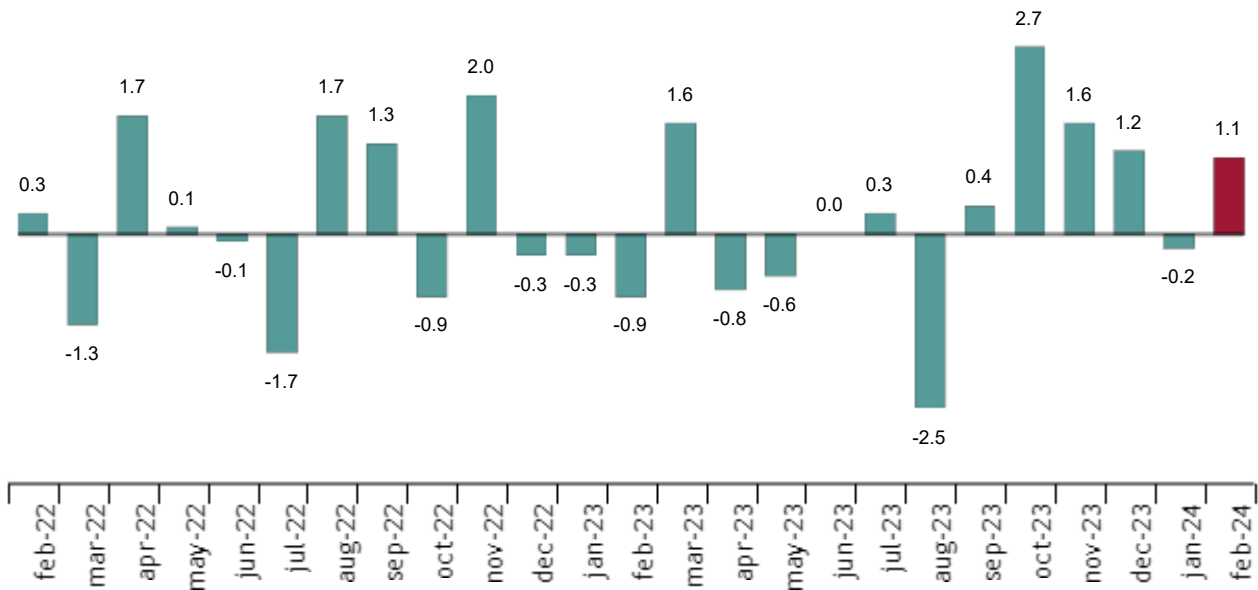
General index of the turnover for the Market Services Sector. Seasonally and calendar adjusted. Monthly rate. Percentage

After adjusting for seasonal and calendar effects, the monthly variation of the general index of turnover for the Market Services Sector between February and January was 1.1%. This rate was 1.3 points higher than that observed in January.